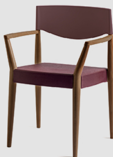
Virna Beach Wood WA