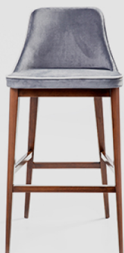
Rift Barstool Wooden