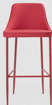
Rift Barstool Metal