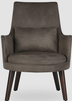
Loop Conic Wood