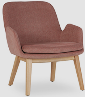
Daisy Lounge Woody