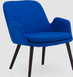
Daisy Lounge Conic Wood