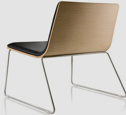
Amarcord Oak shell