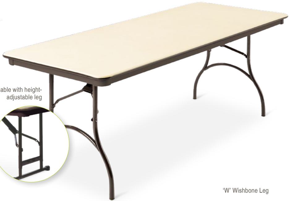
'W' Wishbone Leg