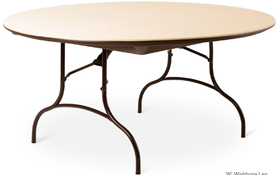
'W' Wishbone Leg